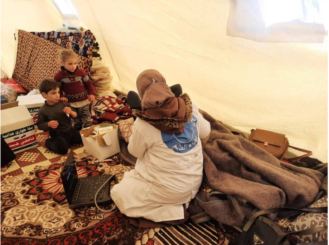
Sarmada's Mobile Team visit temporary shelter camp, February 13-14, 2023, Idlib