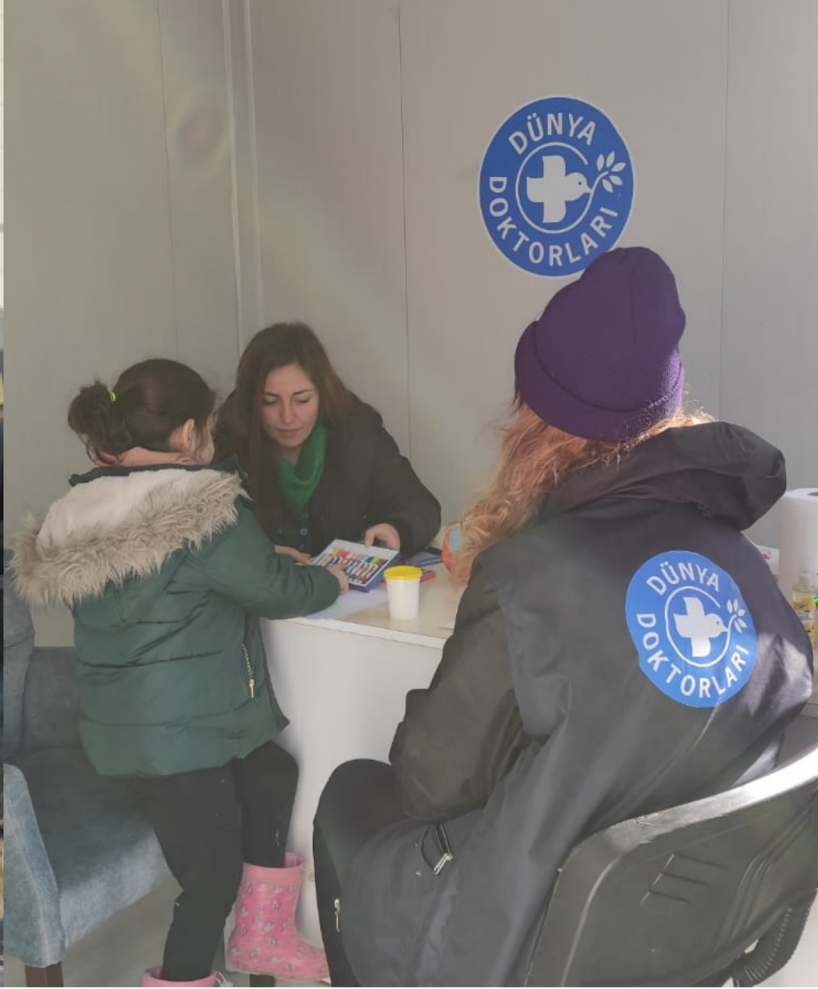
(DoTW Türkiye Mobile Team providing psychosocial support and primary health care services in the field in Hatay, Feb.13-14, 2023)